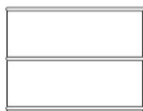
↓ MODULE 1 1台とMODULE 1-1 2台の組み合わせ例