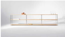
↓ MODULE 1 1台ととMODULE 1-1 2台の組み合わせ例